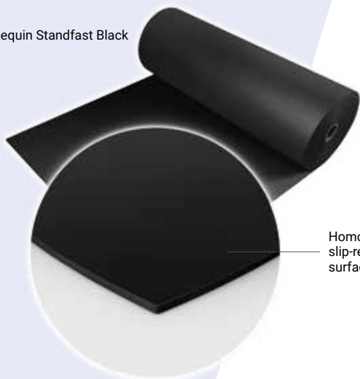
Homogeneous PVC with a slip-resistant performance surface

If you would like further information, advice and samples please contact us on +44(0) 1892 514 888 or enquiries@harlequinfloors.com